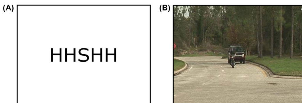
Figure 2. The present study elicited errors through discrimination tasks in simple and complex stimuli. (A) Simple stimuli used in the letter flanker task. The target in this trial, an 'S', is present in the central position and should be reported. Participants made errors in 7.7% of such letter flanker trials. (B) Complex stimuli used in the motorcycle conspicuity task. The target in this trial, a motorcycle, is present, and should be reported. Participants made errors in 6.2% of such motorcycle conspicuity trials.

letter flanker tasks could unbalance the design, as could a substantial difference in cognitive workload between tasks. Therefore, as a manipulation check, overall error rates and subjective workload via the NASA TLX (Hart and Staveland 1988) were collected for each task.